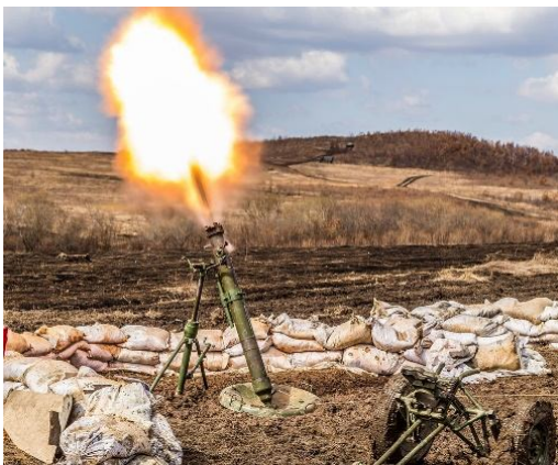
Fig. 3. A moment of a fire of mines from the barrel of a mortar

The barrel is the main part of a firearm intended for pushing a mine with a certain initial velocity and providing it with a stable flight in a given direction. The barrel is a pipe on a support, closed on one side, the bottom of which is the drummer. When a mortar mine is placed in the barrel, the drummer ignites the propellant charge. His burning pushes the projectile out of the barrel (Fig. 3). The thermal energy from the combustion of the powder charge determines the parameters of the internal ballistics: the speed of the mine when it moves in the barrel channel, the direction and initial velocity of the mine at the time of its departure from the barrel [5].