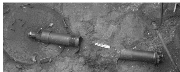
Fig. 1. A mortar barrel rupture

It should be noted that methods of increasing the strength of the barrels are not exhausted [4].